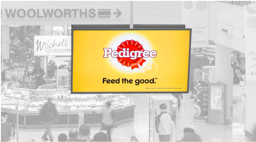
Super screen - 90"