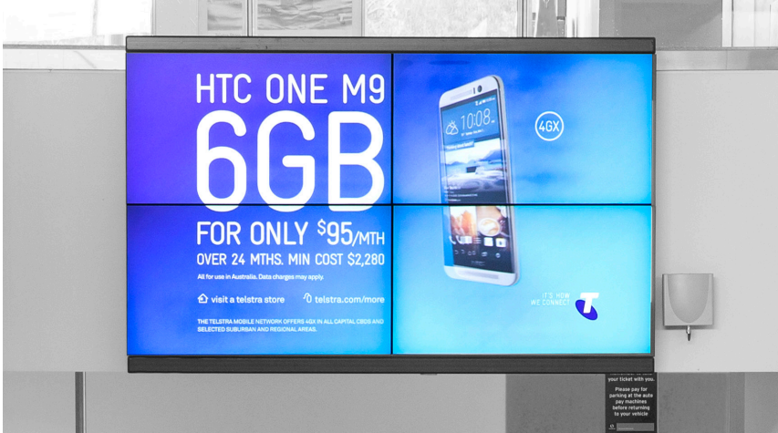
Tiled Super screen 2x2 - 92" screen