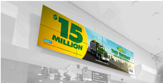
Ultra screen 2x4 (46" screens)